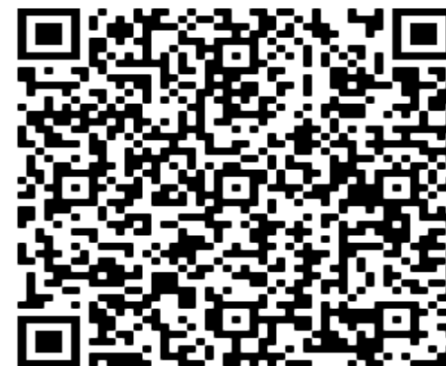
Public Information Map Pilgrim Creek Fire

Visit Tetonfires.com for maps, current fire information, Fire Restrictions and Fire Prevention Tips